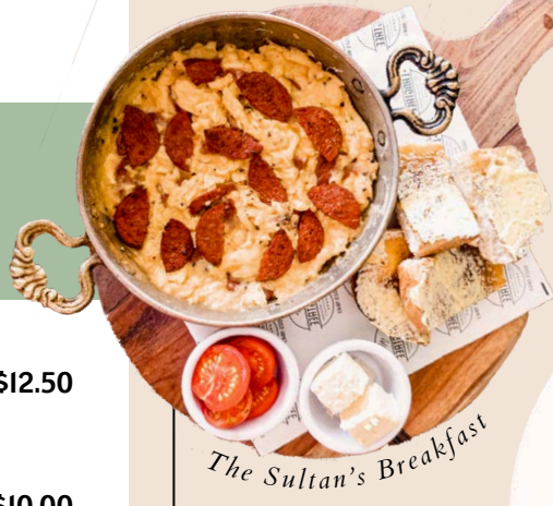
The Sultan's Breakfast