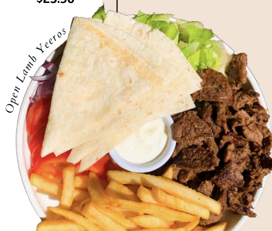
Open Lamb Yeeros

Please inform staff of allergies, as food may contain dairy, gluten or nuts. Our gluten free items are not recommended for customers with Celiac Disease.