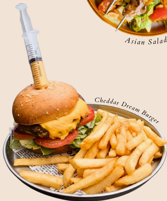
Cheddar Dream Burger