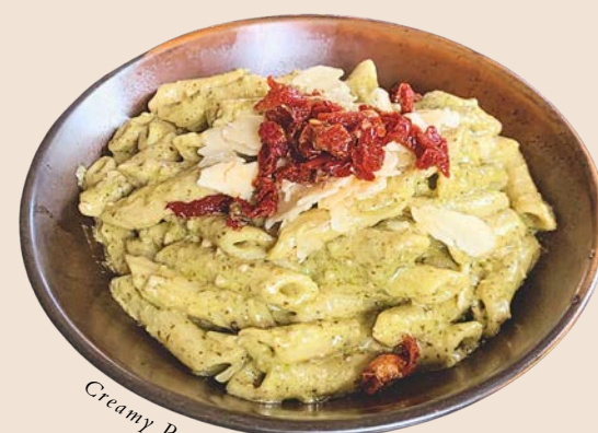
Creamy Pesto w/ Penne