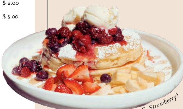
Pancakes (Add Banana & Strawberry)