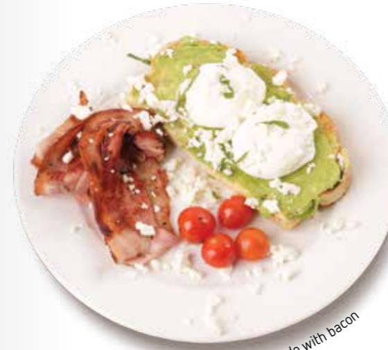
Smashed Avocado with bacon