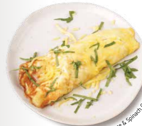
Ham, Cheese & Spinach Omelette